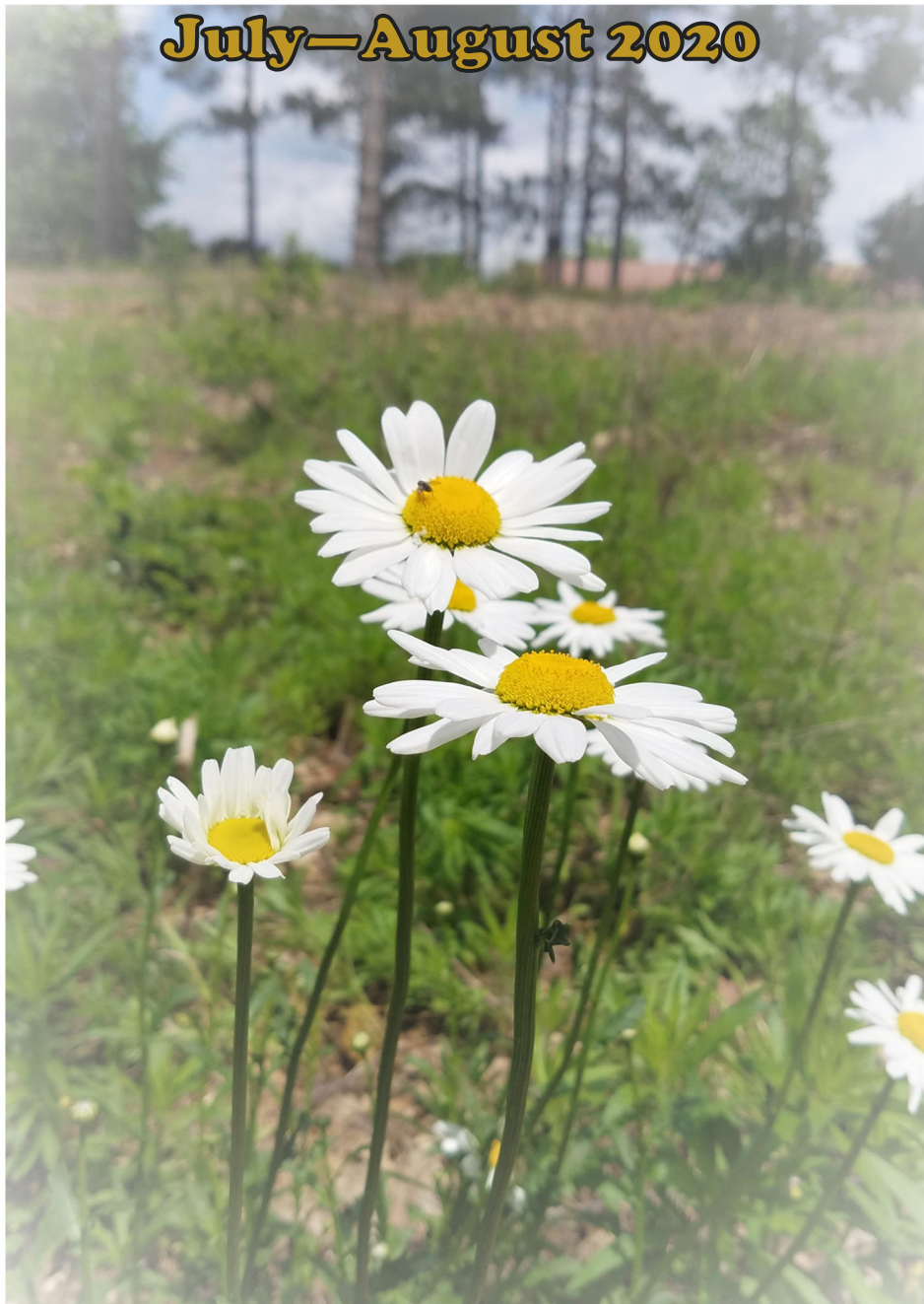
"A glimpse of Gold in Marquette County"