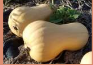
Photo From the Community Garden