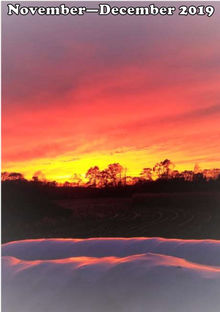
First glimpse of winter!